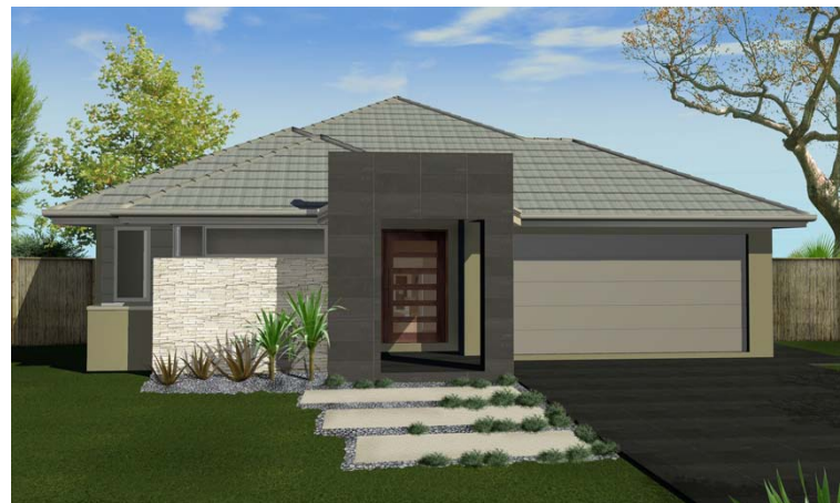
House Size: 209.17sqm * Allbrook façade as shown not included