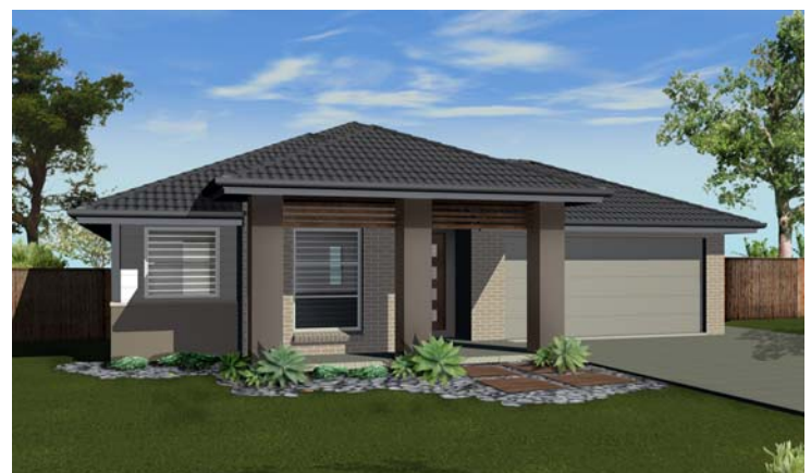
House Size: 241.79sqm * Larson façade as shown not included