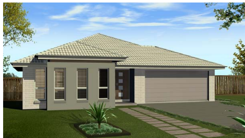
House Size: 172.81sqm